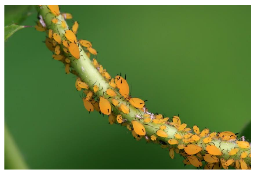
Figure 1. Aphids on a host plant

Aphids are small sap-sucking insects, and members of the superfamily Aphidoidea [18]. As one of the most destructive insect pests on cultivated plants in temperate regions, Aphids have fascinated and frustrated man for a very long time. This is mainly because of their intricate life cycles and close association with their host plants and their ability to reproduce with and without mating [19]. Fig. 1 shows some aphids on a host plant.